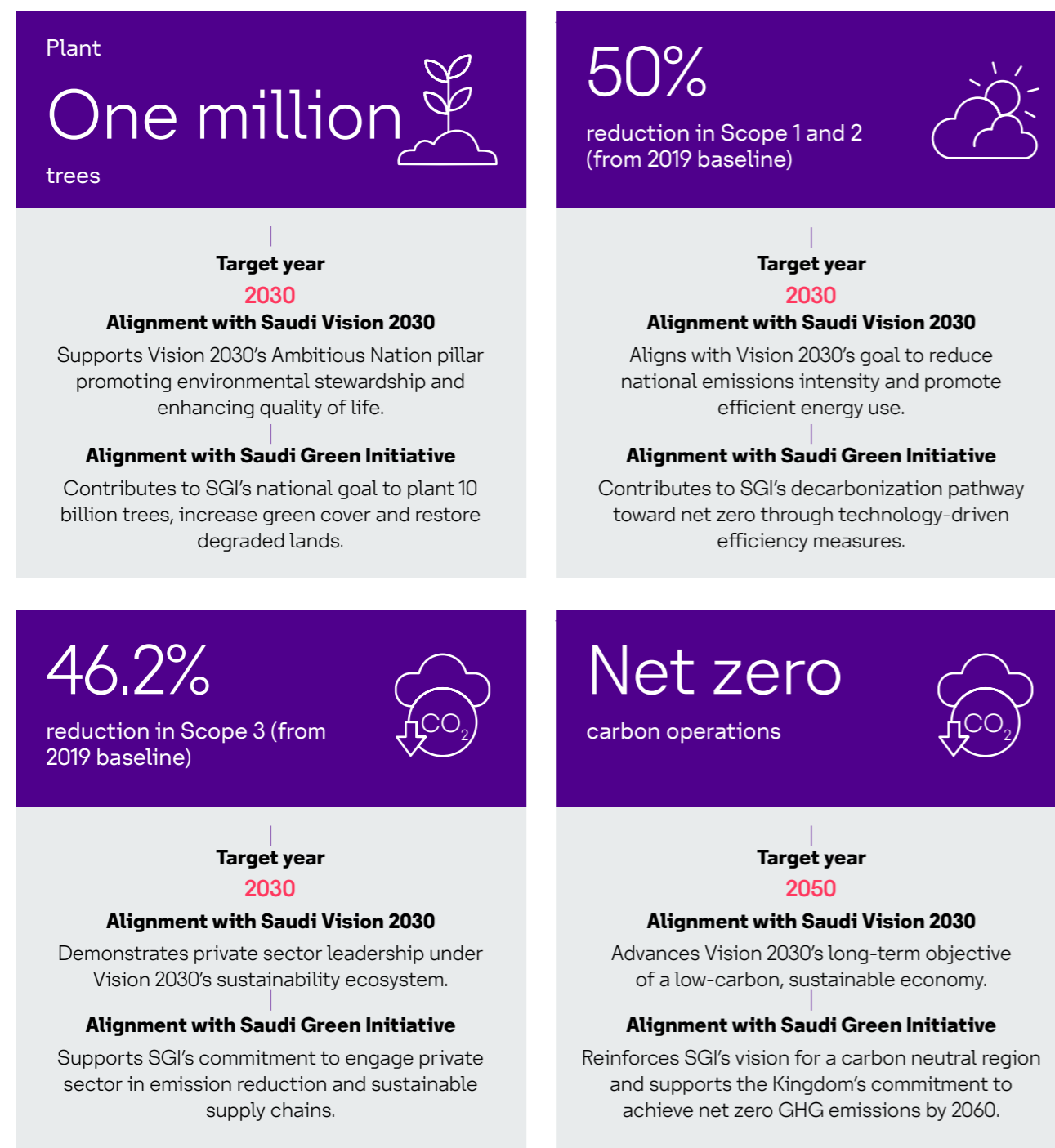
Figure 1 - stc group climate commitments aligned with Saudi Vision 2030 and SGI

stc group's climate action roadmap focuses on four strategic pillars: